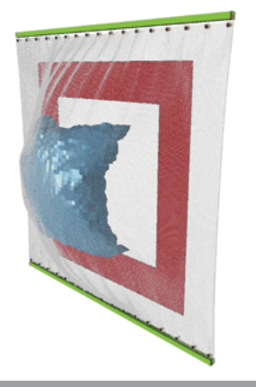
Figure 2: FEA Simulation