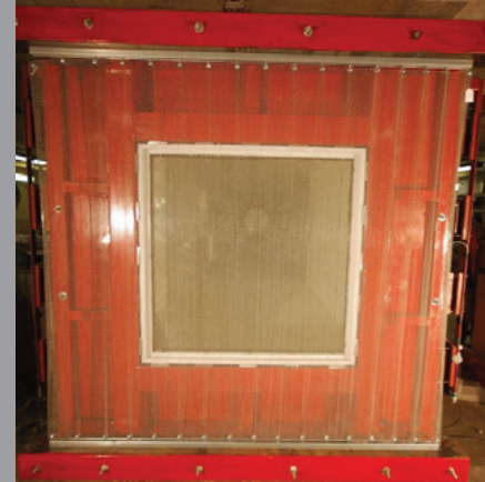
igure 1: Shock Tube Test Setup Figure 2

displacement and other critical performance factors. Results applied to predictive modeling and analysis for retrofit building installation (Fig. 3) illustrate the ability to withstand an exterior truck bomb explosion.